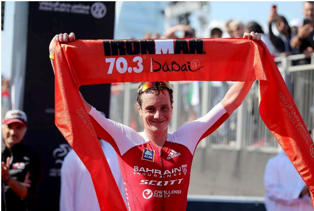
WELCOME BACK: Double Olympic Champion Alistair Brownlee of Great Britain celebrates his first victory after coming back from surgery on his hip at IRONMAN 70.3 Dubai in the United Arab Emirates – (Photo by Nigel Roddis/Getty Images for IRONMAN) – Download