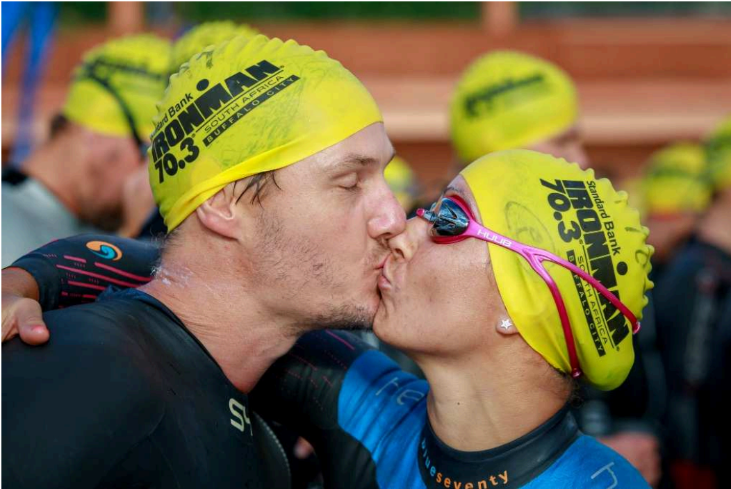
ONE LAST KISS: Two athletes embrace before the start of the Standard Bank IRONMAN 70.3 South Africa in Buffalo City – Download