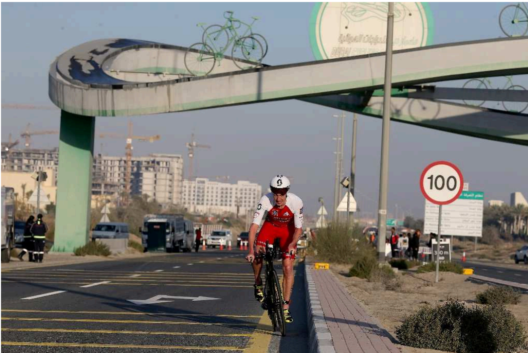
WATCH THAT SPEED LIMIT: Alistair Brownlee of Great Britain was in a league of his own at IRONMAN 70.3 Dubai in the United Arab Emirates, completing the 90,1 km bike course in just 1:58.51 hours – (Photo by Nigel Roddis/Getty Images for IRONMAN) – Download