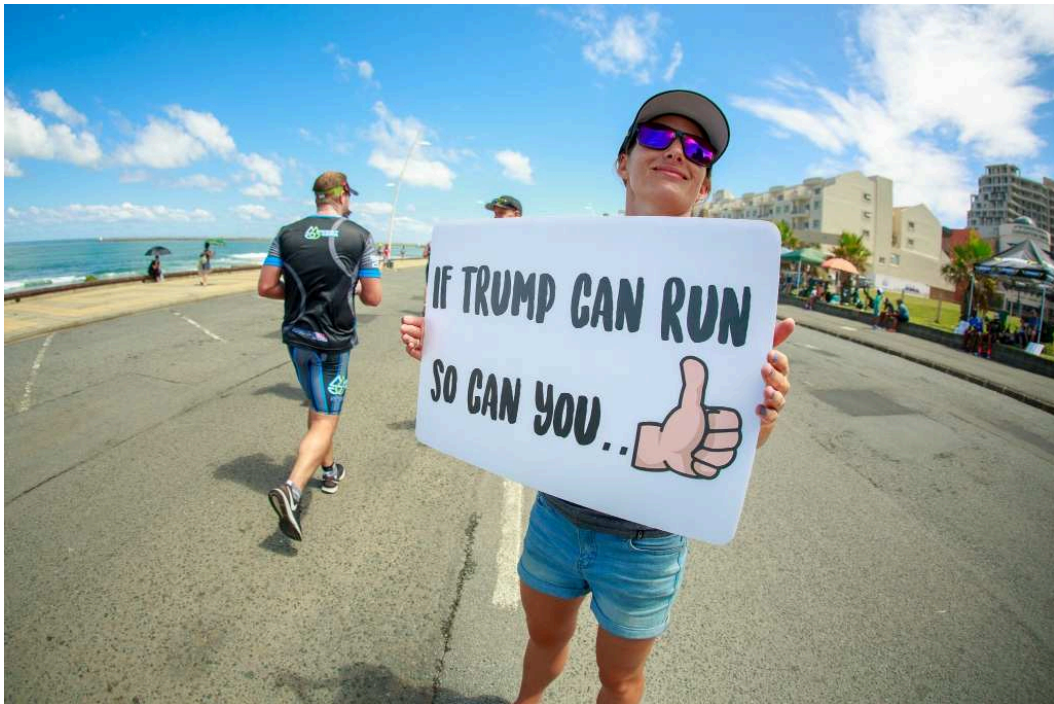
MAKING A STATEMENT: A spectator provides tongue-in-cheek encouragement to the athletes on the run course of Standard Bank IRONMAN 70.3 South Africa in Buffalo City – Download