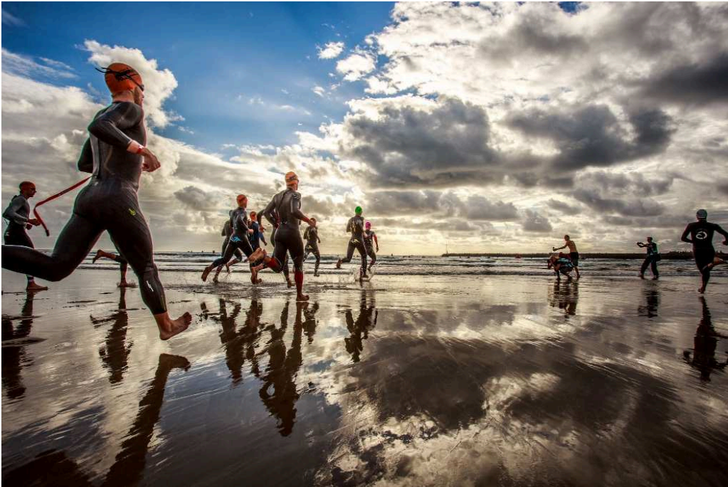
MEN IN THE MIRROR: Athletes at the Standard Bank IRONMAN 70.3 South Africa in Buffalo City start their race with a 1,9 km swim in the Indian Ocean – (Photo by Chris Hitchcock/IRONMAN) – Download