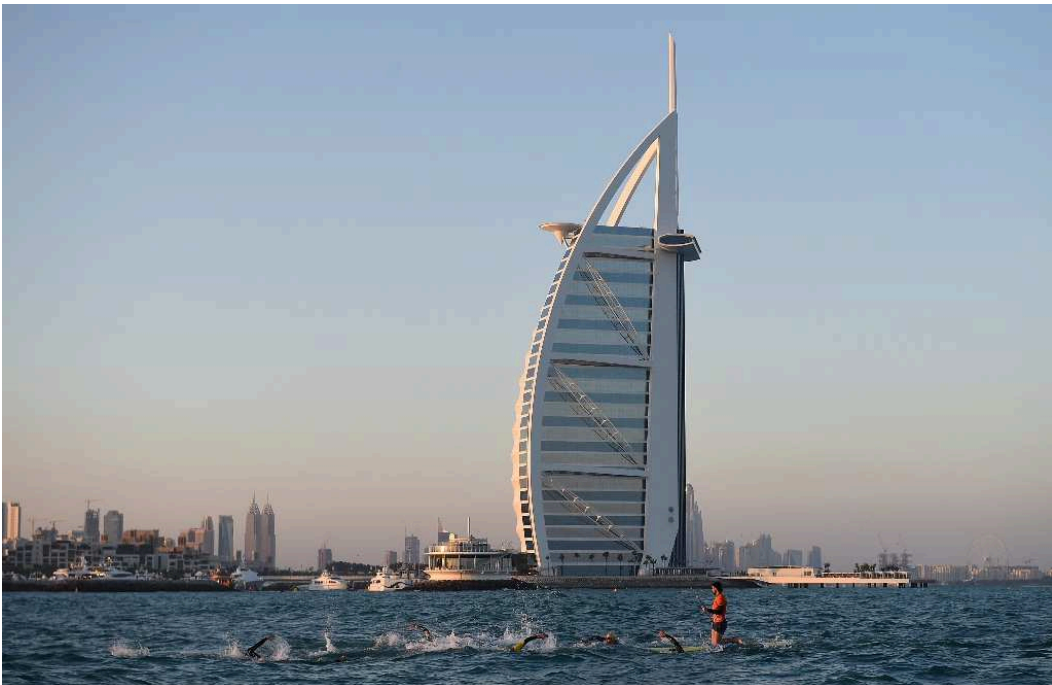
WITH THEIR SAILS SET: The Burj Al Arab luxury hotel provides a stunning backdrop for the swim course of the third IRONMAN 70.3 Dubai in the United Arab Emirates – Download