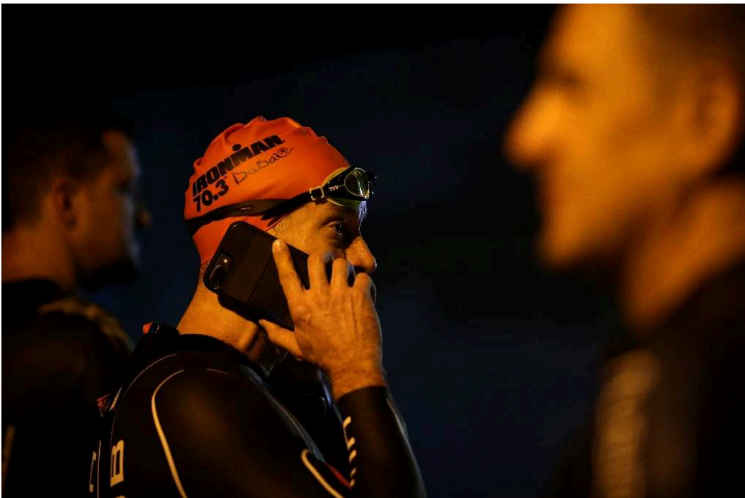
ONE LAST CALL: Prior to the start of IRONMAN 70.3 Dubai in the United Arab Emirates, athletes prepare among other things, with words of encouragement from friends and loved ones – – Download