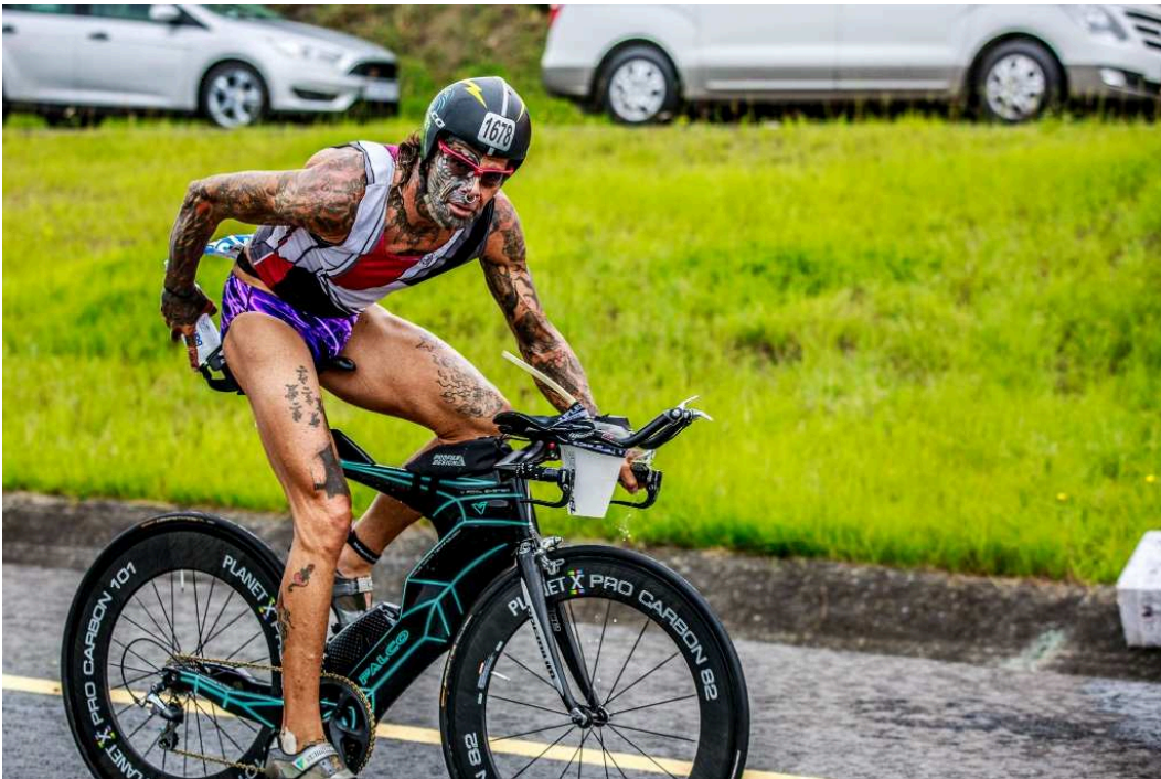
HALF MAN, HALF MACHINE: An athlete displays an extensive set of tattoos on the bike course of the Standard Bank IRONMAN 70.3 South Africa in Buffalo City – (Photo by Chris Hitchcock/IRONMAN) – Download