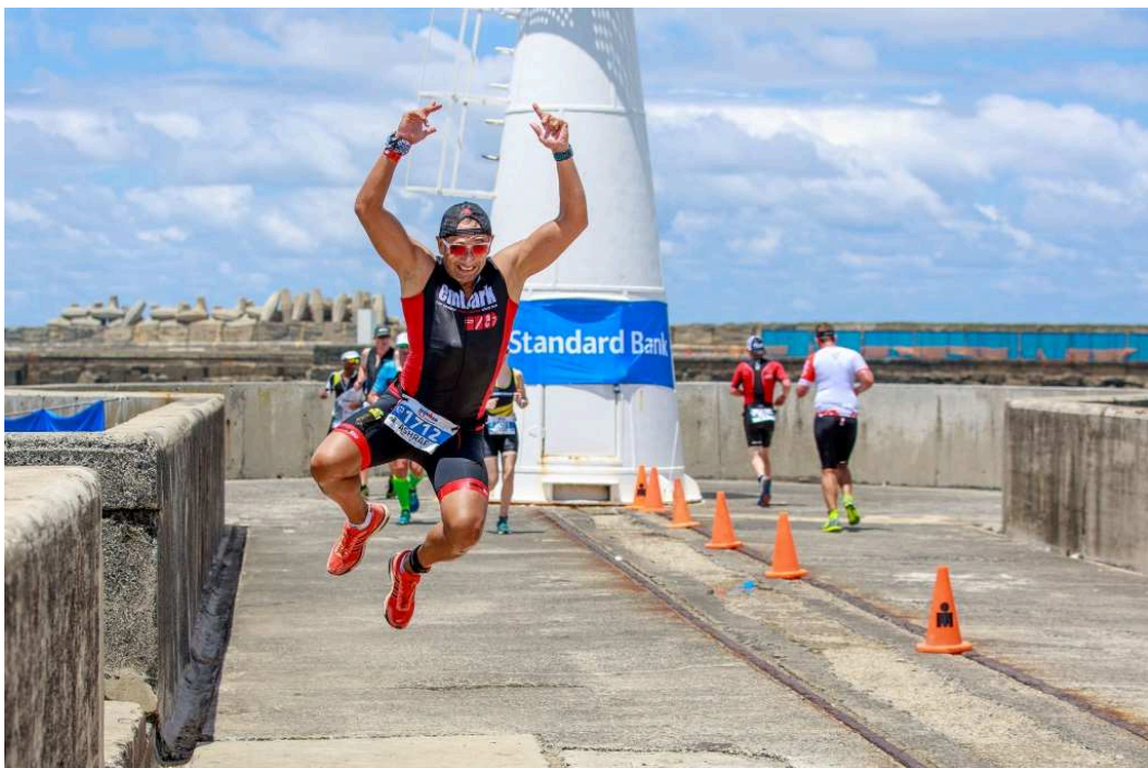
AH, MIGHT AS WELL JUMP: An athlete defies gravity on the run course of the Standard Bank IRONMAN 70.3 South Africa in Buffalo City – Download