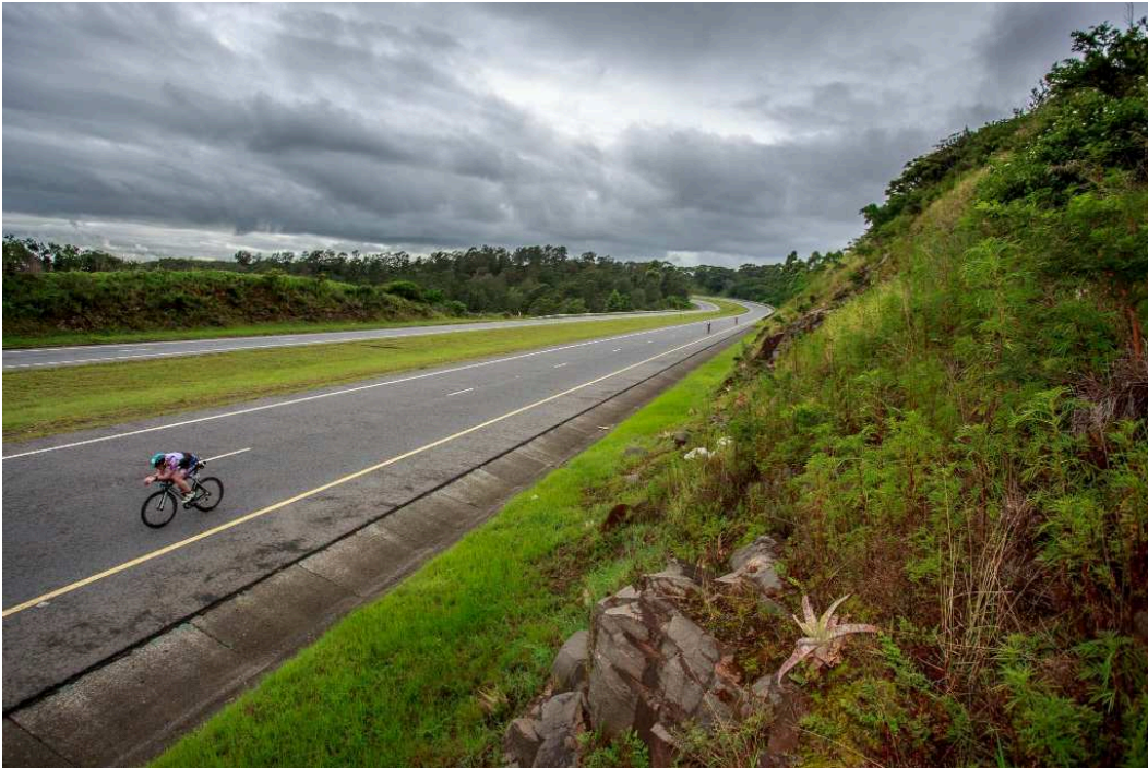
PUTTING SOME DISTANCE IN BETWEEN: A group of cyclists is seen on the bike course of the Standard Bank IRONMAN 70.3 South Africa in Buffalo City – Download